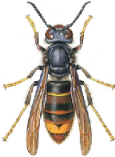
Asian Yellow-legged Hornet Vespa velutina