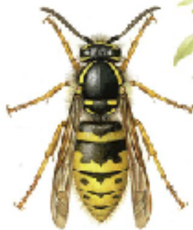
Common Wasp Vespula vulgaris