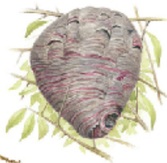
Nest of Median Wasp