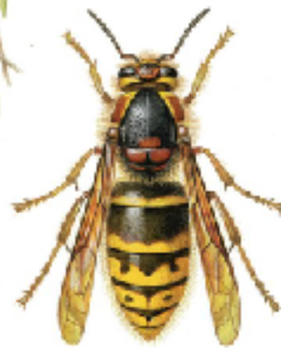
Median Wasp Dulichovespula media